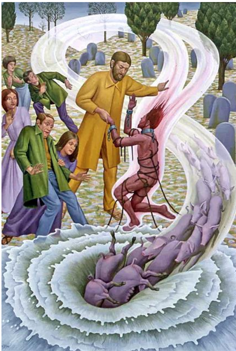
Casting Out Evil Spirit by Peter Koenig (1991), United Kingdom