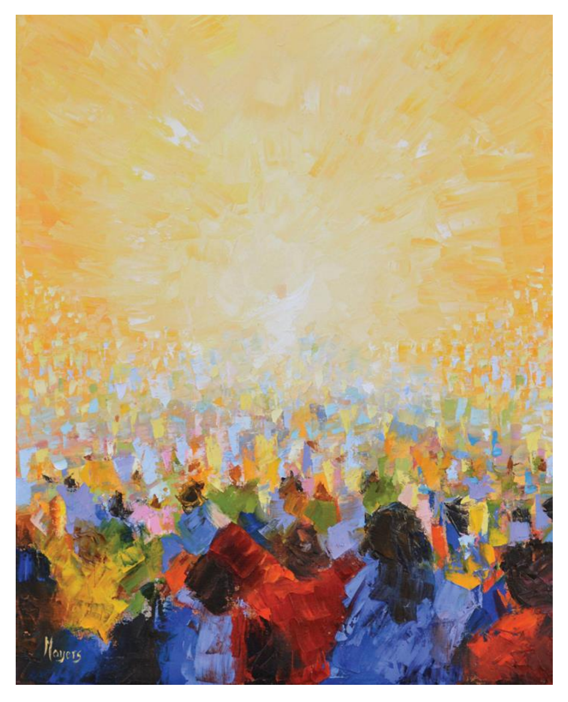
Caster Sunday Doylestown Presbyterian Church