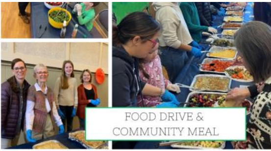
FOOD DRIVE & COMMUNITY MEAL