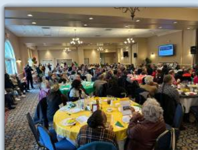
<u>Southwest Mission Trip</u> A dedicated team of DPCers once again made the trip to help at the Food Pantry in Gallup, NM and assist members of the community