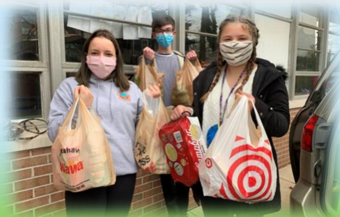
DPC Youth assisted with DPC's monthly food drive in November.

CHRISTMAS EVE OFFERING. This year's Christmas Eve offering will support the Presbyterian Disaster Assistance's response to the COVID-19 pandemic, which has brought hardship to people living all over the world. For more information or to make an additional donation, visit https://pda.pcusa.org/situation/covid-19/